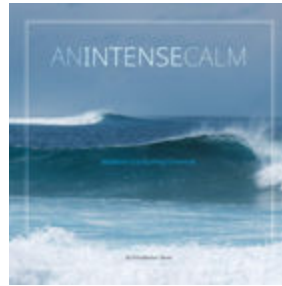
www.AnIntenseCalm.com Self-Authored and Photographed